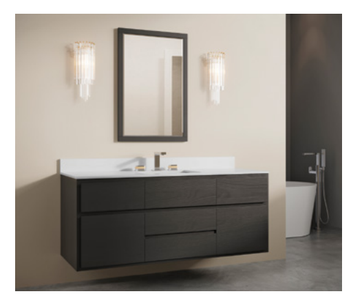
Colville bath vanity in Midnight Oak finish with Midnight Oak drawers

Complements for the Colville vanity include mirrors, built-in outlets, finger pulls or decorative hardware, offering designers and homeowners alike new and exciting ways to personalize and create luxurious bath spaces. Comparable to a piece of heirloom furniture, all models feature heavy-duty drawer glides and dovetail drawers.