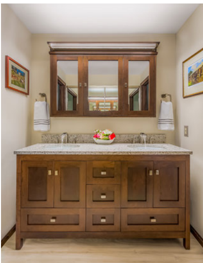
Alki vanity pairs with a 48-inch Tri View medicine cabinet with overhanging LED light