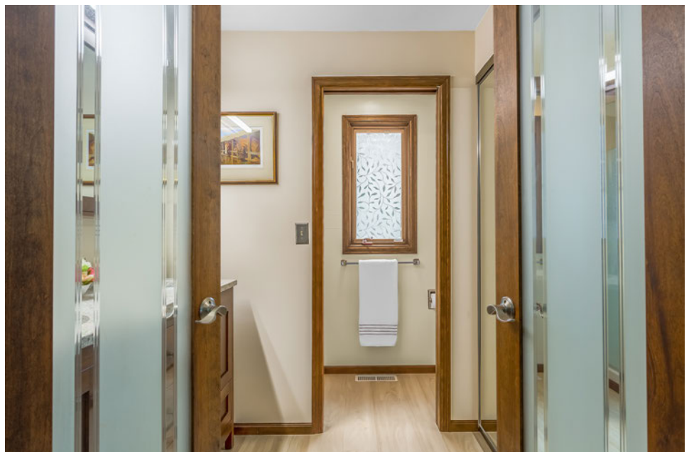
Etched-glass French doors give elegant touch, while bringing in light