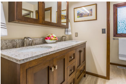
Alki vanity with quartz countertop complements chocolate cherry stained cabinet finish and flooring

The first step was to replace the worn-out flooring with wood-look vinyl that was both durable and light-toned. The second bold move was the incorporation of the Alki vanity from Strasser Woodenworks . Versatile in function as well as in style, Alki's clean sophistication—complete with Shaker doors, dovetail drawers, and slender rectilinear legs—elevates not only contemporary bathrooms, but is perfect for transitional baths like Kirkendall's. The 60-inch Alki "Essence" model Kirkendall chose offered room for dual