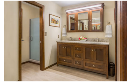
Kirkendall chose versatile Alki vanity in Essense model

Like all of Strasser Woodenworks' vanities, Alki is manufactured wholly in the USA using solid wood doors and dovetail drawers and solid-wood legs. Finishes are hand-rubbed. All wood species are sourced from the US or Canada.